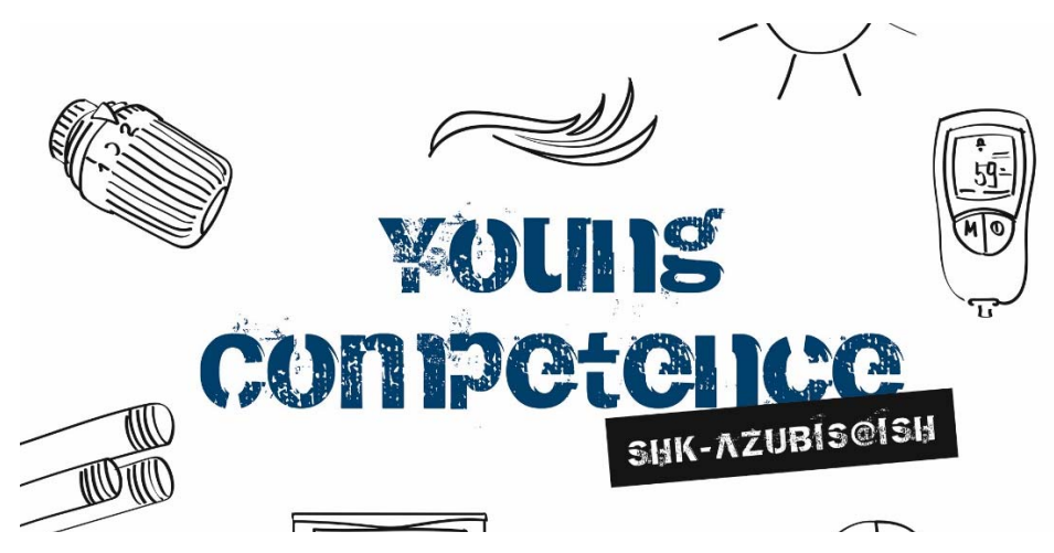
Young Competence –the Career @ ISH section is one of the key items on the programme and exists to foster new blood in the sanitary, heating and air-conditioning industry.

Skills @ ISH covers a whole series of lecture forums and further development opportunities at the trade fair. These include the ISH Technology and Energy Forum, the Building and Real-Estate Forum – which will, for the first time be extended to include the BIM@ISH Forum as well – together with the Air-conditioning and Refrigeration forum and the Stove Forum.