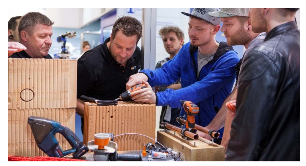
Skills @ ISH offers a broad range of practical professional development opportunities in the ISH complementary programme.

The Selection @ ISH section covers, for instance, the Trend Forum 'Pop up my Bathroom', the renowned 'Design Plus' competition - which rewards selected products and technical solutions - together with a number of guided tours of the trade fair. These are all approaches, therefore, that provide a condensed overview for the trade visitors.